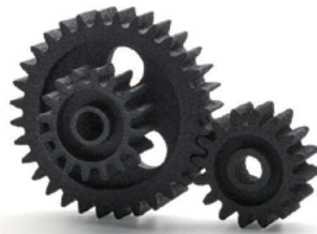
Picture taken after dye post-processing

Get precise small features and detail such as small fine holes, walls and shafts with dimensional accuracy thanks to HP's unique Multi-Agent printing process